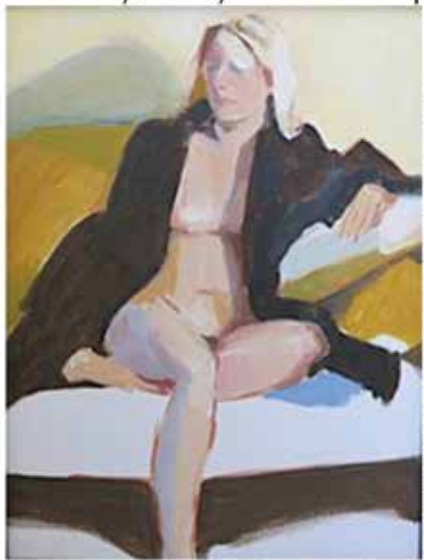
-The Black Robe by Robert Sponsele, 12" x 14" oil on canvas.